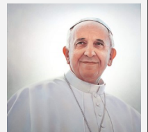
Pope Francis July 18, 2021

During summer time, let us learn how to take a break, turn off the mobile phone to gaze into the eyes of others, cultivate silence, contemplate nature, regenerate ourselves in dialogue with God.